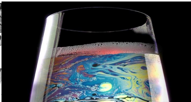
Agnieszka Polska, „Watery Rhymes”, 2014

The exhibition “Ministry of Internal Affairs: Intimacy as Text” showcases a polyphony of voices in poetry and visual arts whose common mode of expression is a first person narrative and a confessional character of statements, while self-representation in language becomes a discursive practice of reflection and questioning and struggle for the artist’s subjectivity.