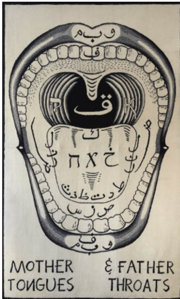
Slavs & Tatars, „Mother Tongues and Father Throats", carpet, 300×490 cm, 2012 Collection of the Museum of Modern Art in Warsaw