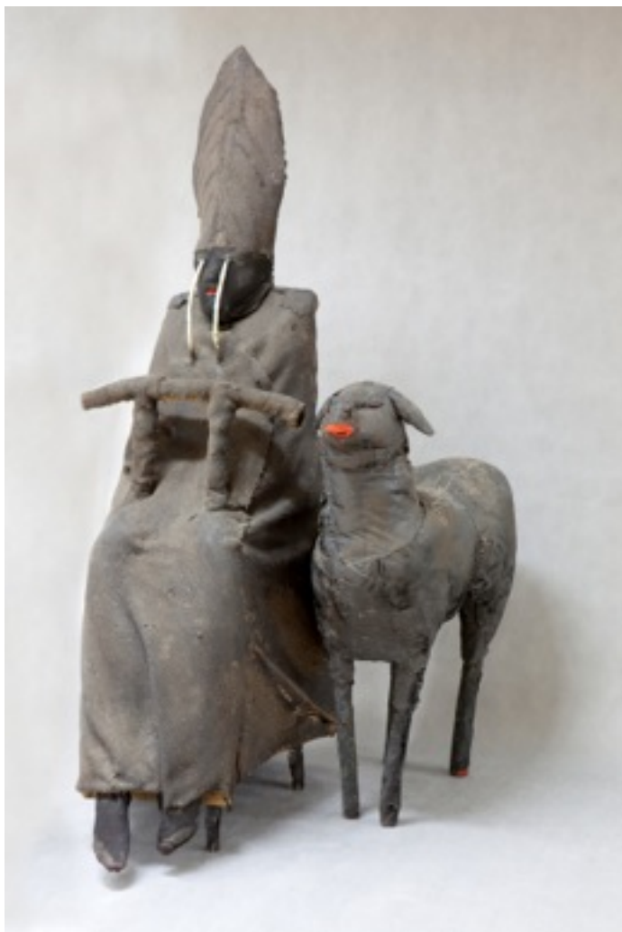
Mirosław Bałka, „Black Pope, Black Sheep”, wood, carpet, textile, steel, paint, 161 × 60 × 97 cm, 1987

Collection of the Museum of Modern Art in Warsaw