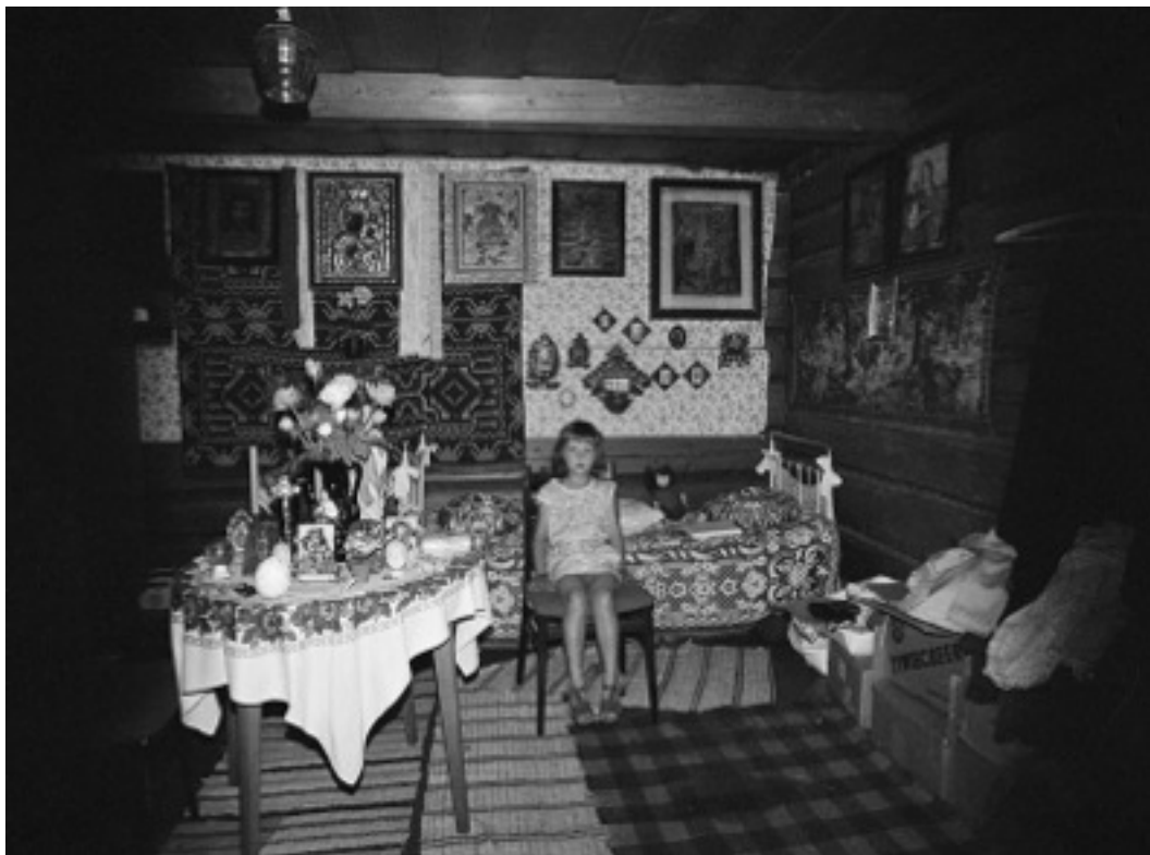
Zofia Rydet, from the series „Sociological Record", photograph, 1978–1997

Rydet had already reached an advanced age when she began to work on what would become her magnum opus: the „Sociological Record" a sweepingly comprehensive photographic "portrait" of Polish domestic life that would come to span decades, regions, and even countries. Many of her photographs combine the disciplines of portraiture and still-life documentation: we see a person in a room, and we also see a room and all of its individuating details surrounding and indeed elaborating upon the person facing the camera. A following selection from the body of over 16.000 negatives focuses on the material manifestations of the spiritual life of the Polish countryside.