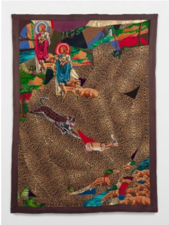
Gülsün Karamustafa, „Double Jesus and the Baby Antelope", textile collage, 185 × 230 cm, 1984

In the mid-to-late 1980s Karamustafa while working as an art director in film, began to appropriate wall carpets that could be found in the homes of migrants from the Turkish countryside. This series of textile collages earned her the label of 'arabesque painter'. Double Jesus and the Baby Antelope is a work the artist sewed together out of commercially available wall-hangings such as can be purchased at the Grand Bazaar.