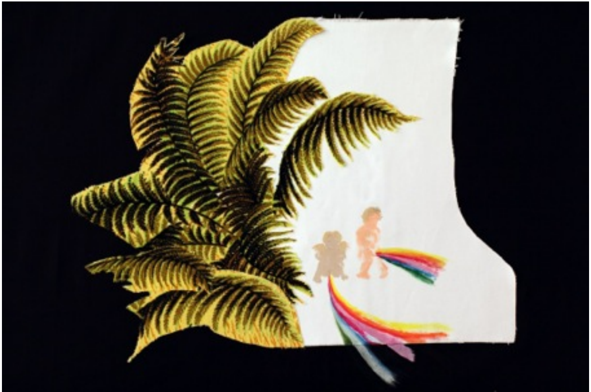
Nilbar Güreş, „Rivers of Heaven", mixed media on fabric, 82 × 90cm, 2011

Using a medium traditionally associated with the art of woman, she makes collages that subvert, often in a playful way, the accepted ways of representing themes like religion or femininity, using explicit or even scatological imagery. Rivers of Heaven, with two angels urinating with a rainbow stream, make a clear reference to the representation of Paradise, present in the fifteenth verse of chapter 47 of Quran: “(Here is) a Parable of the Garden which the righteous are promised: in it are rivers of water incorruptible; rivers of milk of which the taste never changes; rivers of wine, a joy to those who drink; and rivers of honey pure and clear.”