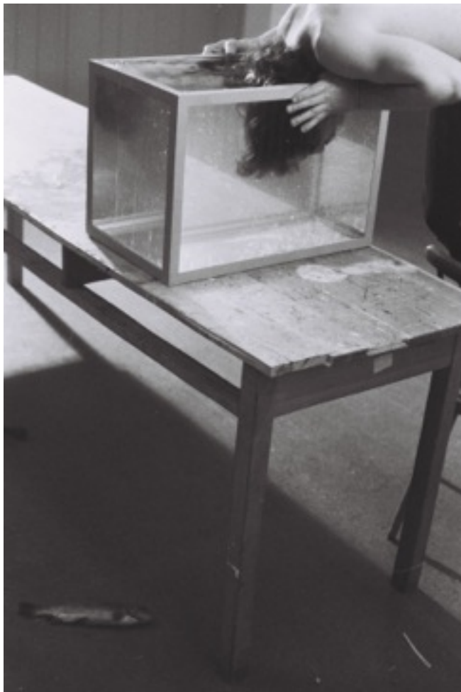
Zbigniew Warpechowski, „Autopsy", documentation of the performance, 1974

In the action called Autopsy Warpechowski submerged his head in the aquarium, from which a moment before he had taken out a fish. The audience could experience consequences of this exchange of ecosystems – a simultaneous suffocation of the artist and the fish. The action was intended as a philosophical and poetic warning - just as the fish does not survive immersion in such an illusory, conceptual water - so people do not survive long in a seemingly objective, rational reality, that slowly sucks life, spirituality and humanity out of them, and that is not their proper "ecosystem".