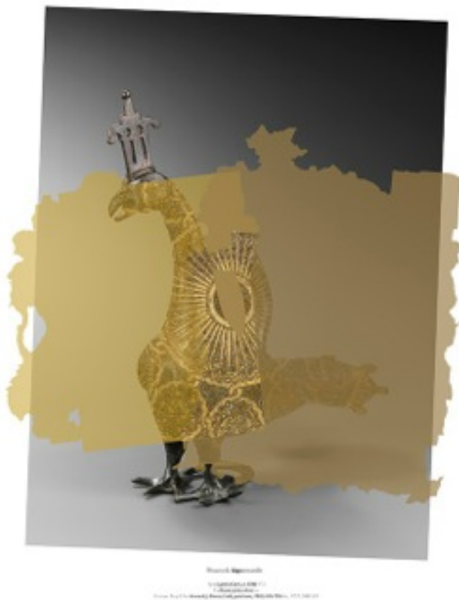
Walid Raad, „Scratching on things I could disavow: Prologue" (Département des Arts de l'Islam _ Louvre) (detail), 2007-2014

In 2007 Raad initiated an art project on Islamic, modern, and contemporary art in the Arab world. The artist wrote: "I present works that relate to my ongoing engagement with "Islamic Art" and "Modern Arab Art" - their objects, shapes, colors and lines; their institutions, discourses, stories and histories; their creators, sponsors, and viewers". Raad shares a fictional story on the mysterious escapade of Islamic artworks from Paris to Abu Dhabi which after a few decades evolve in surprising way, they "trade skins, limbs, faces and organs with each other". Their morphing identity brings forward the question of striking similarity between religious rituals and codes of contemporary art institutions, with its secular "shrines" and "holy relics".