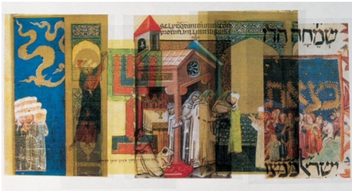
Gulsun Karamustafa, „Trellis of my mind" (detail), colored illustrations copied onto a transparent film, 3 panels, 30 × 150 cm (each), 1998

„Trellis of My Mind" is a narrow frieze that shows about 300 colored illustrations from Islamic, Christian, and Jewish manuscripts copied onto transparent film and then superimposed and overlapped so as to create a kind of visual space containing our collective past. The proximity and affinity of the three religions are rendered apparent inasmuch as the pictures themselves and their structures resemble each other closely.