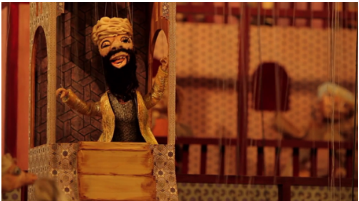
Wael Shawky, „Cabaret Crusades: The Path to Cairo”, film still, 2012 Collection of the Museum of Modern Art in Warsaw

The film „Cabaret Crusades: The Path to Cairo” is a part of Wael Shawky’s project dedicated to the Crusades, reinterpreted according to Arabic chronicles and historical documents. The source material for the screenplay was Amin Maalouf’s book “The Crusades Through Arab Eyes”. This hour-long film covers events which occurred during the 48 years from the end of the first crusade in 1099 until the beginning of the second in 1147. The film adheres to puppet-show conventions, and contains elements of musicals, popular science programmes, nativity plays, and even horror.