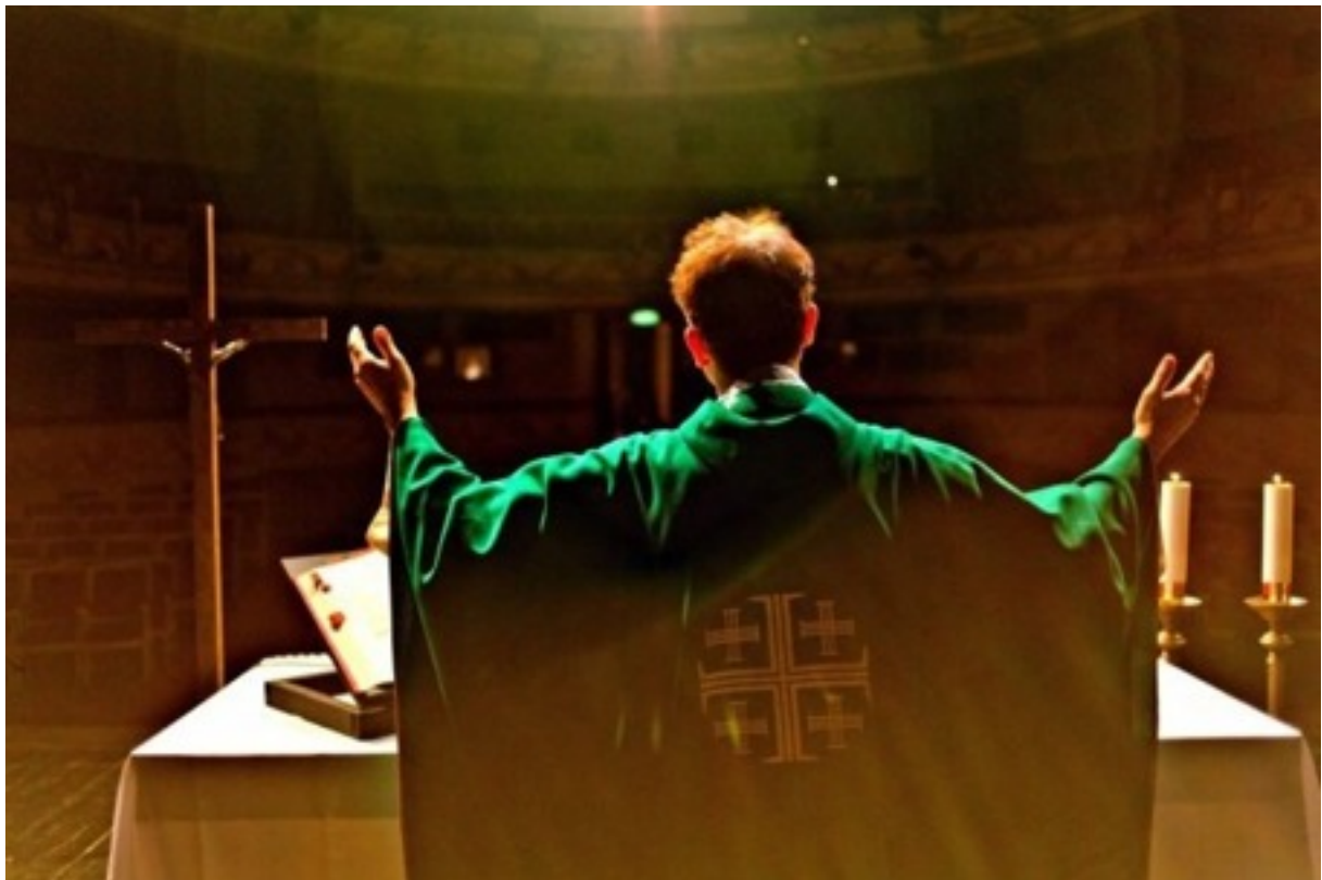
Artur Żmijewski, „The Mass”, film still, 2011

„The Mass” documents the rehearsals and the theatrical re-enactment of the liturgy of the Roman Catholic mass, with professional actors cast in the lead roles. Żmijewski organized the performance in the Dramatyczny Theater in Warsaw in order to test the theatrical quality of "the most commonly staged play in Poland". Though the performance was an “exact copy” of the original, the final aim of the mass – the transfiguration of the wine and bread into the body of Christ - did not happen. The performative function of the language failed in the secular context and the prayer turned into the powerless set of words.