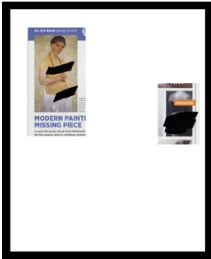
Fayçal Baghriche, „Family Friendly" series, mixed media on paper, 38 cm x 43.5 cm, 2012

The series „Family Friendly" consists of a collection of covered-over images taken from art magazines found in Dubai. In the United Arab Emirates, like in many Muslim countries images of nudity are prohibited in the public sphere. Images that include nudity are hidden underneath hand-made ink marks. Each image becomes unique. Baghriche is interested in the aesthetic and social value of these hybrid images.