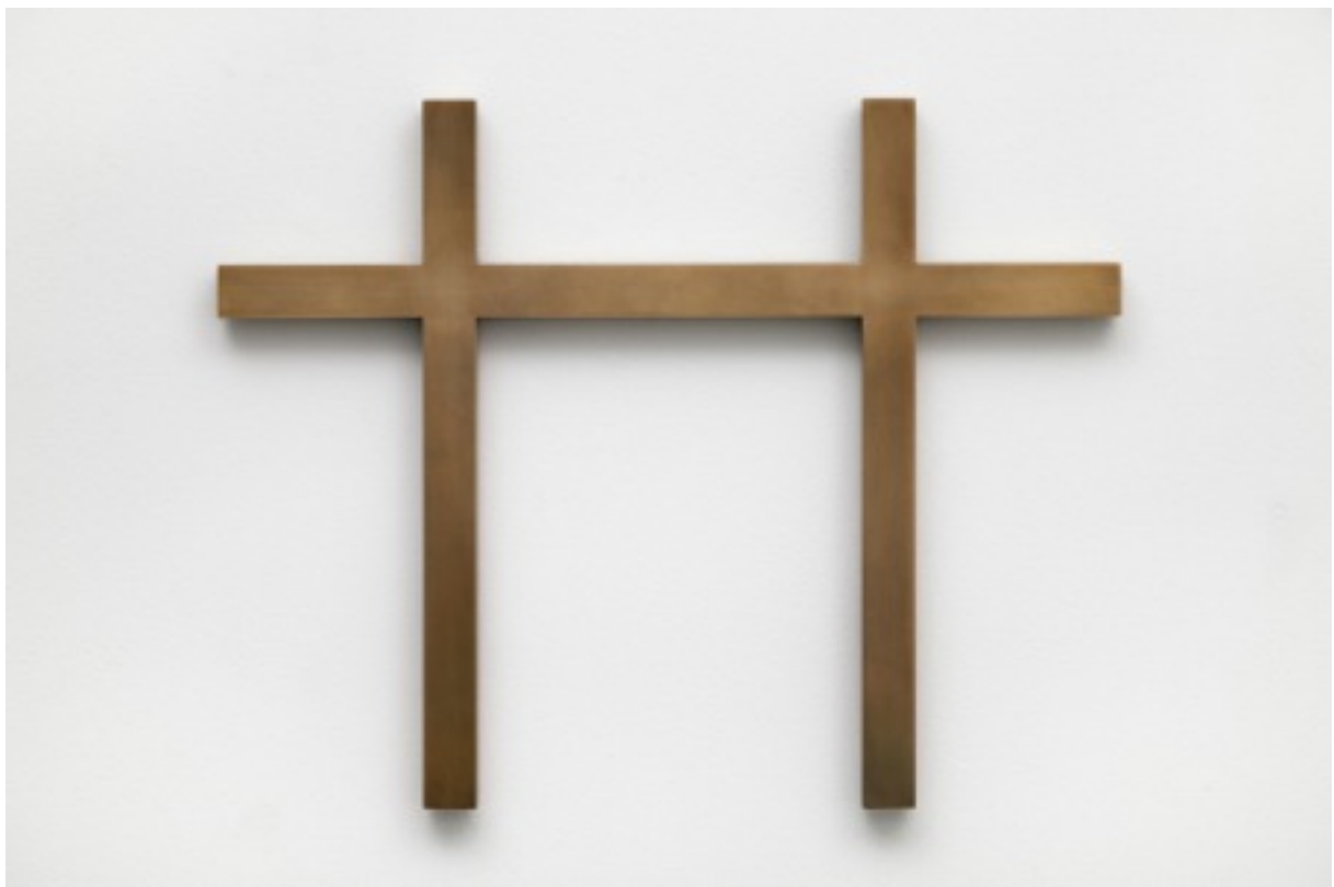
Jonathan Horowitz, „Crucifix for Two”, olive wood, 33 × 41.9 cm, 2011 Collection of the Museum of Modern Art in Warsaw

„Crucifix for Two” comes from the series of works in which the artists tests the relationship between pure aesthetics of minimalism and semantic power of symbols. Horowitz underlines the impotence of the elegant abstract forms of minimal art to commemorate traumatic events or refer to the current socio-political reality. He uses simple blocks of wood, which bring to mind sculptures of Robert Morris, and composes them into the doubled sign of the cross – the most powerful symbol of Christianity. Hence he also subverts the traditional religious symbolism and by turning singular torment of the savior into a shared suffering, he refers to the struggle and oppression of gay people.